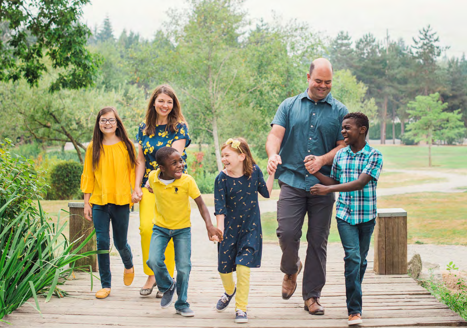
Carrie Fox Photography, 2018.